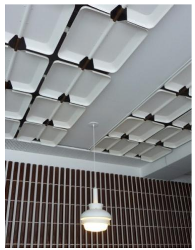
Concave shaped, white aluminium plates were manufactured by Oy Sohlberg Ab in Finland. Photo Seija Linnanmäki 2012.

Ceiling heating in National Pensions Institute was specially designed in the Lunch room, where the suspended ceiling is not a common false ceiling but a heating device as well. Concave shaped white aluminium plates were manufactured by Sohlberg Oy and fixed straight to the heating pipes working in the same time as an architectural ceiling covering and a heating device.<sup>28</sup>