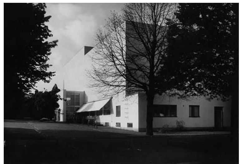
Vyborg Library 1935. Sun shades over the windows. In addition to mechanical and electrical systems in his architecture, Aalto used also traditional passive methods to control the indoor climate.