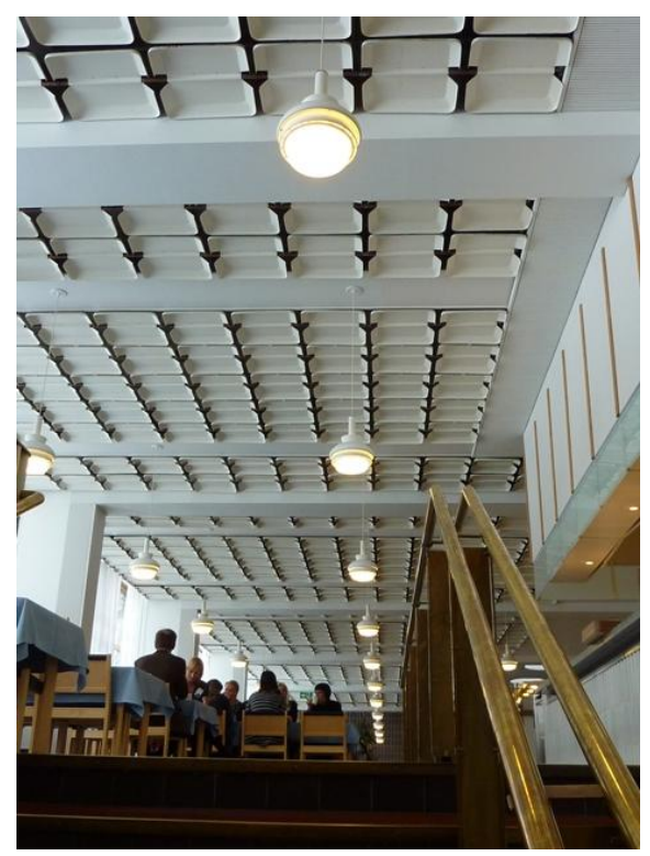
Ceiling heating in lunch room at the National Pensions Institute was purpose designed by Aalto.

Ceiling heating in National Pensions Institute was specially designed in the Lunch room, where the suspended ceiling is not a common false ceiling but a heating device as well. Concave shaped white aluminium plates were manufactured by Sohlberg Oy and fixed straight to the heating pipes working in the same time as an architectural ceiling covering and a heating device.<sup>28</sup>