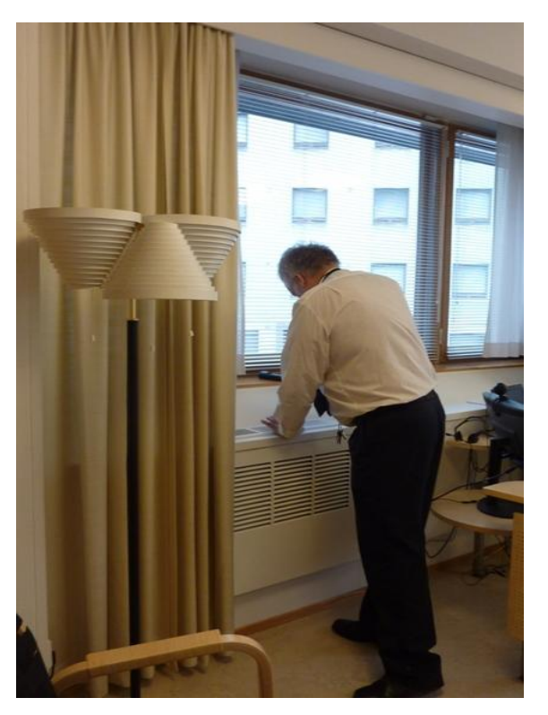
Office room with Carrier Weathermaster fan coil unit under the window sill. Original system is restored and still in use.

Another case on Aalto's innovative approach on technical systems to look closer, is the National Pensions Institute, Helsinki, built in 1953-1957,<sup>18</sup> one of the Docomomo architectural masterpieces of Finnish Modernism. In National Pensions Institute Aalto used many experimental structural and technical systems, here I will present two of them, architecturally designed radiant ceiling heating as well as one of the first fully air-conditioning systems in Finland, world famous Carrier Weathermaster system.