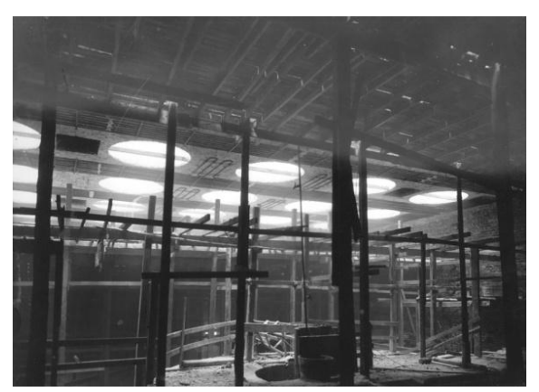
Radiant ceiling heating coils by Crittall, 1935.