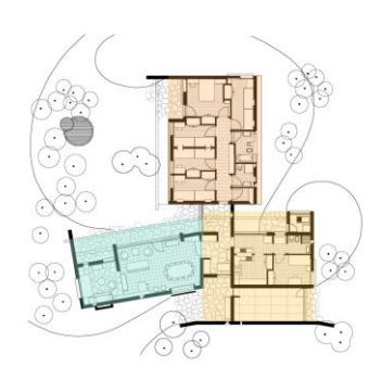
Plan of Holiday House in Ofir. Drawing by Ana Isabel da Costa e Silva 2012.

Álvaro Siza interprets the Holiday House in Ofir as a work in close liaison with regional tradition, while simultaneously representing an approximation to a Nordic modern spatial structure (SIZA 1987:186). In the floor plan we see a combination of three volumes with distinct functions. The North entrance is placed at the junction of the living room volume with the services one (kitchen, garage, room service, laundry), in a discrete way. The third volume, perpendicularly aligned with the other two, has the biggest openings to east.