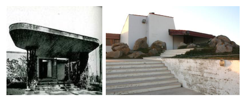
Entrance: Villa Mairea and Boa Nova Tea House. Image from L'Architecture d'Aujourd'hui n. 29, 1950, p.22 and photography by Ana Isabel Costa e Silva 2012.

Inside, the space was divided into three structural spaces: the entrance, the bar and the restaurant. Among the programmatic and formal division of the interior, the entrance is located asymmetrically in relation to the whole building.