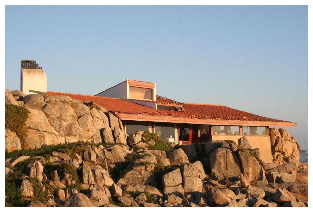
Boa Nova Tea House and wooden traditional fisherman house in Portugal.

Therefore, these two buildings – Villa Mairea and Boa Nova Tea House – represented an enlargement in their countries culture on building construction, regarding the use of wood that became a strong influence on architectonic production of later generations.