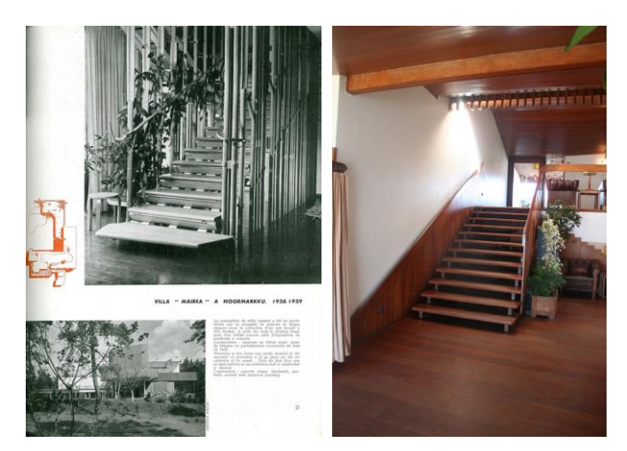
Stairs: Villa Mairea and Boa Nova Tea House. Image from L'Architecture d'Aujourd'hui n. 29, 1950, p.21 and photography by Ana Isabel Costa e Silva 2012.

Also, in Alvar Aalto's buildings the entrance is never pompously decorated, but unostentatiously welcomes the person in (Jetsonen 2005: 9). At the Boa Nova Tea House , the relationship of the various elements is done harmoniously in a way that attracts and directs the individual movement as it happens in Villa Mairea .