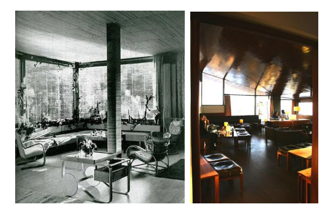
Villa Mairea's living-room and Boa Nova Tea House's bar L'Architecture d'Aujourd'hui n. 29, 1950, p.23 and photography by Ana Isabel Costa e Silva 2012.