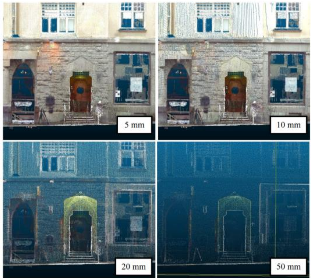
Figure 2. The visual effect of modifying the point density of point cloud data that's presented as a point cloud. (Figure: A-Insinöörit Suunnittelu Oy 2017).

Currently point cloud data is mostly used as initial data for renovation design and modeling existing structures. However, the data can be used also as is. Especially data presented as a mesh can be used for visualization. The third option is to combine these two ways of utilizing the data and partly using the data as is and partly data that has been modeled based on the point cloud data.