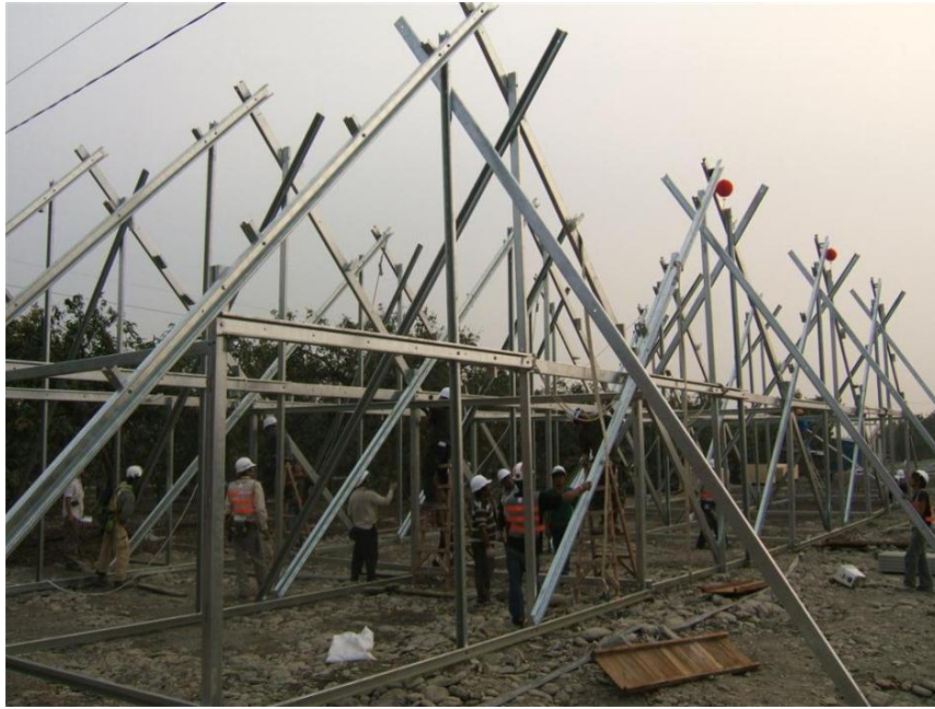
Figure 6: Steel frame with simplified joints with nuts and bolts for the reconstruction work at

Fu-shan Village, Dawu, Taitung, Taiwan, 2010.