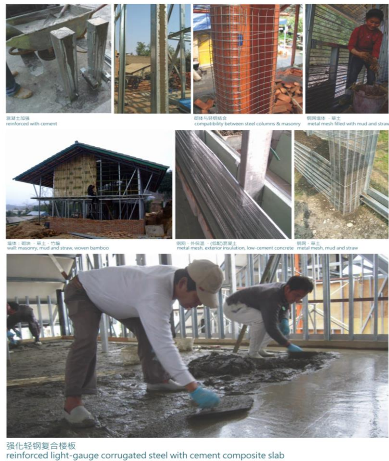
Figure 8: HEISH and his team provided their innovative construction methods to build the

structing the membrane, roof and floors of re-built houses.